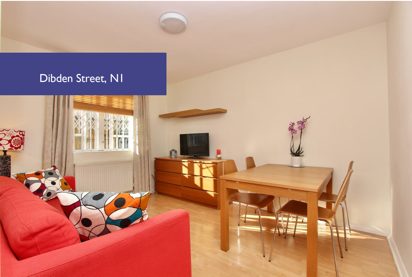
Dibden Street, N1